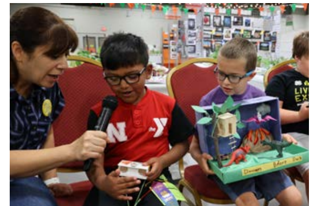
Clover Kids are 4-H’ers ages 5–7. This age group participates non-competitively in static exhibits, Show & Tell (pictured), animal showmanship and Fashion Show modeling.