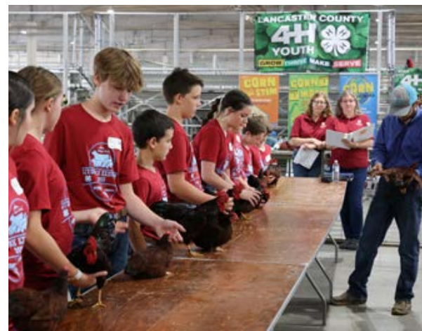
4-H small animal shows, such as poultry, rabbits, cats, dogs and household pets, are an opportunity for urban and rural youth to experience raising and showing animals. Pictured is judging of Rhode Island Red Bantams.