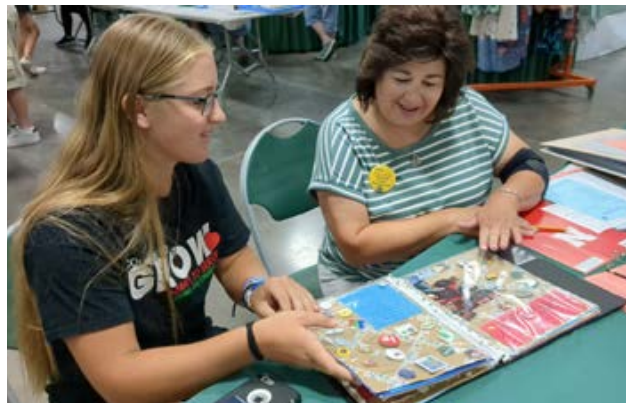
The Super Fair features the largest county 4-H static exhibit display in Nebraska. This year, 374 4-H’ers entered 2,446 static exhibits. On judging day, youth can talk to judges about their projects (pictured is a youth interview judging her 4-H Member Scrapbook).

The 2025 Lancaster County Super Fair was held July 31–Aug. 9 at the Sandhills Global Event Center. The fair is an opportunity for 4-H & FFA youth to showcase projects and skills they’ve worked on throughout the year. 4-H fair experiences help youth become “beyond ready” for their life and career. At this year’s Super Fair, 549 4-H & FFA exhibitors entered 4,765 exhibits (including static exhibits, Clover Kids, animals and contest entries). Lancaster County 4-H thanks all the volunteers and sponsors who make 4-H youth learning experiences possible!