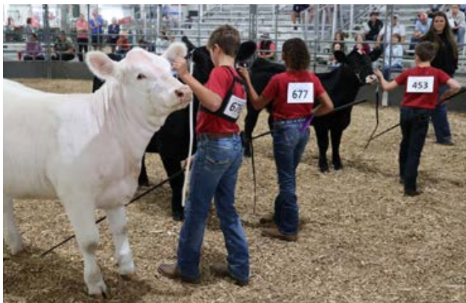
4-H & FFA livestock shows are a vital part of Nebraska’s agriculture industry, helping grow the next generation of livestock producers. Pictured is Beef Junior Showmanship.