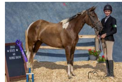
Paige Schepers, Hunter Hack Champion

The 2025 Fonner Park State 4-H Horse Expo was held July 12-16 in Grand Island. There were 188 exhibitors, 315 horses, 1,673 entries representing 42 Nebraska Counties. Here are the Lancaster County 4-H purple ribbon and top 10 winners. Complete results are at http://4h.unl.edu/horse/state-expo .