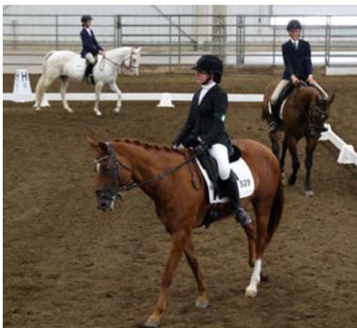
Lancaster County has the largest 4-H county fair horse show in the state, with 41 events spanning 5 days. Horses are an important part of Nebraska’s agriculture industry. Pictured is English Dressage.