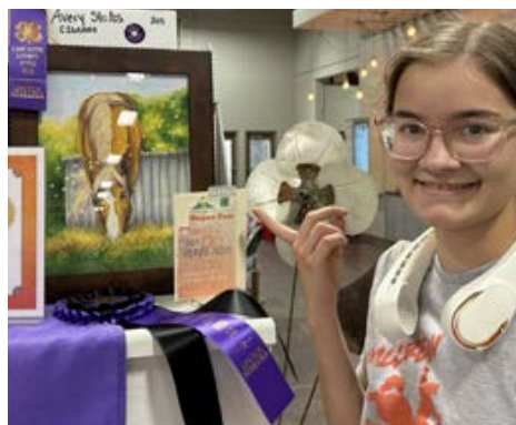
Visual Arts Top 4: Avery Stohs (colored pencil drawing of a palomino horse)