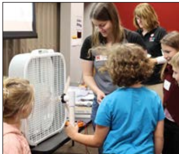
Last year's Homeschool Youth Science Day included a "Power of Wind" station.

Nebraska Extension in Lancaster County will present a Homeschool Youth Science Day on Tuesday, Nov. 4, 9 a.m.–12 p.m. OR 1–4 p.m. at the Nebraska Extension in Lancaster County conference rooms, 444 Cherrycreek Road, Suite A, Lincoln. Open to all homeschooled youth, grades K–6th (most lessons are geared towards 3rd–5th graders). Youth will focus on lessons involving science, technology, engineering and math (STEM) activities. Fee is $10 per youth. Please pay in advance by either calling 402-441-7180 with a credit/debit card (small fee) or mailing/delivering a check or cash to Lancaster County Extension, 444 Cherrycreek Rd, Suite A, Lincoln, NE 68528. Register online at https://go.unl.edu/homeschool-science-25 by Monday, Oct. 27. Please choose either the morning session, 9 a.m.–12 p.m., or afternoon session, 1–4 p.m., on the registration form. There is a set limit of 60 youth per session.