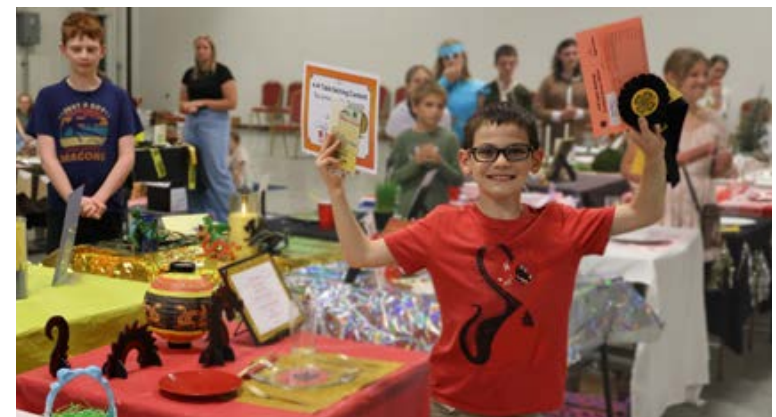
The 4-H Table Setting contest is a fun way to learn how to set a table, plan a menu with healthy foods and give a short presentation to a judge.

See video how 4-H at fair helps youth at go.unl.edu/fair-beyond-ready