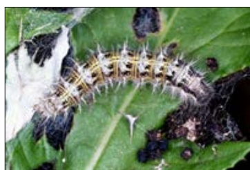
Painted Lady Butterfly Caterpillar ( Vanessa cardui )

Host Plant: Herbs in the carrot family ( Apiaceae )