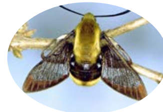
Snowberry Clearwing ( Hemaris diffinis )