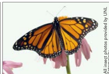
Monarch Butterfly ( Danaus plexippus )