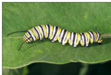
Monarch Butterfly Caterpillar ( Danaus plexippus )

Learn more about National Pollinator Week at: www.pollinator.org/pollinator-week .