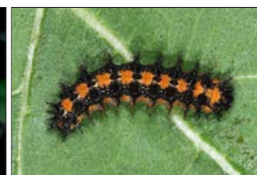
Gorgone Checkerspot Butterfly Caterpillar ( Chlosyne gorgone )

Host Plants: Thistles ( Cirsium spp.), hollyhocks ( Alcea ), mallow ( Malva ) and more.