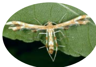
Plume Moth (Family: Pterophoridae )