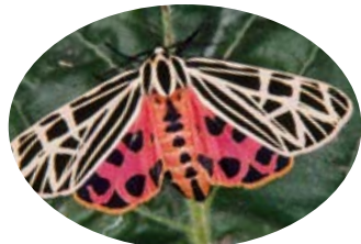
Virgin Tiger Moth ( Apantesis virgo )