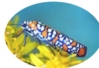
Ailanthus Webworm Moth ( Atteva aurea )