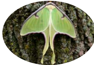
Luna Moth ( Actias luna )