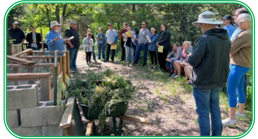
In Lancaster County, Extension Master Gardeners are encouraged to join a committee, such as the compost committee, in which members teach the public about composting during demonstrations in the spring and fall.