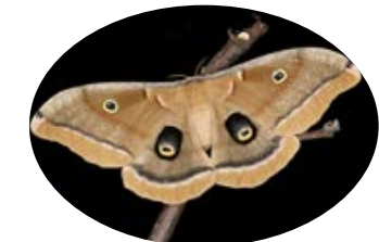
Polyphemus Moth ( Antheraea polyphemus )