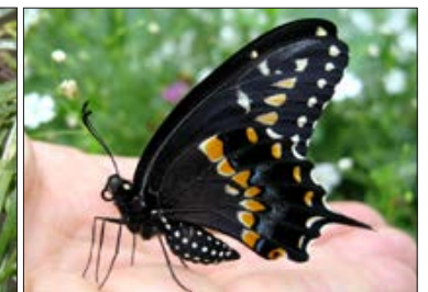
Black Swallowtail Butterfly ( Papilio polyxenes )

Host Plant: Herbs in the carrot family ( Apiaceae )