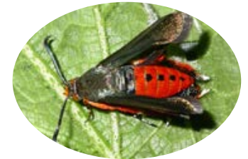
Squash Vine Borer ( Eichlinia cucurbitae )