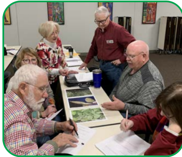
New and returning Extension Master Gardener Volunteers receive training each year. Pictured are participants learning about integrated pest management in a small group discussion.