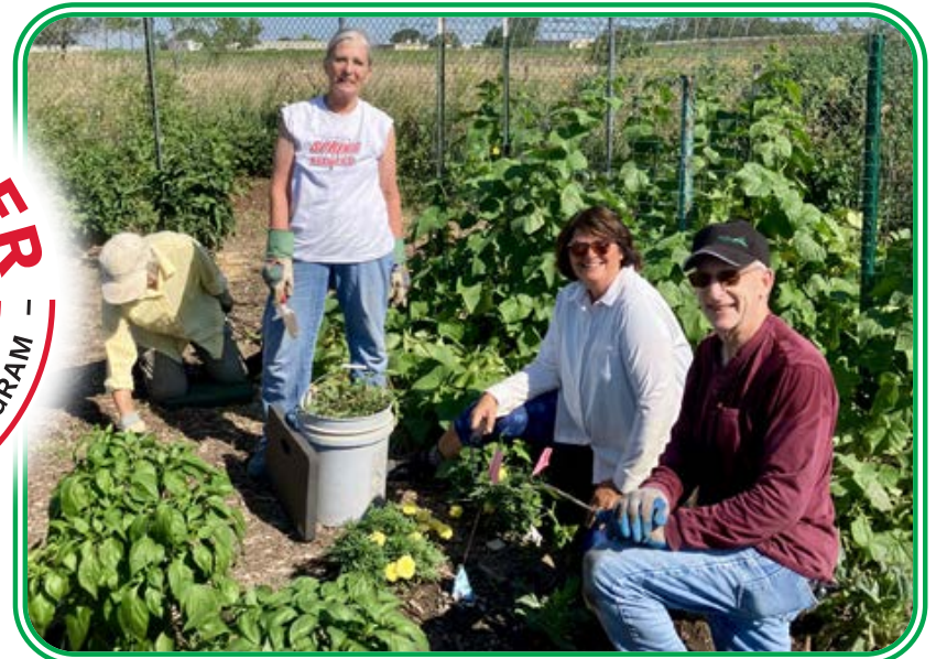
Members of the People's City Mission Garden team plan, plant and harvest vegetables and herbs at the garden, which are then used in the PCM kitchen.