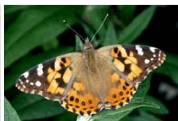
Painted Lady Butterfly ( Vanessa cardui )

Host Plants: Thistles ( Cirsium spp.), hollyhocks ( Alcea ), mallow ( Malva ) and more.