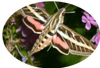
White-lined Sphinx ( Hyles lineata )

This annual event also offers a great opportunity to get involved in citizen science by photographing and documenting moth species in your area. Here are just a few of the unique and remarkable moths you might encounter in our state.