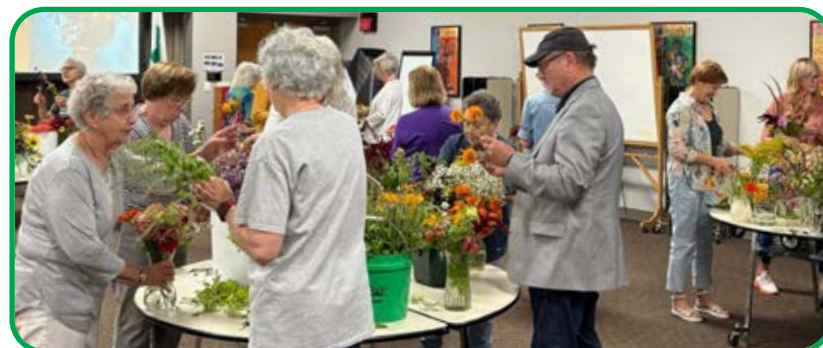
Event Committee members plan activities or events for EMGVs, like the flower arranging event pictured.