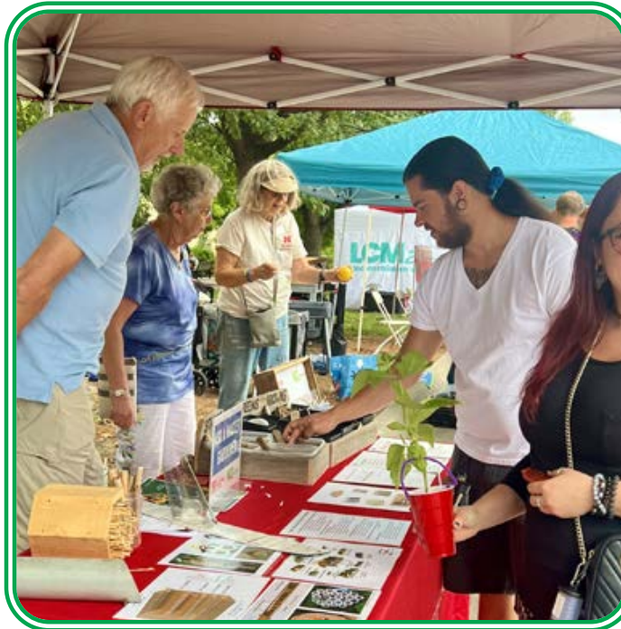
Members of the youth education committee staff a booth at Discovery Days on UNL East Campus, providing education and hands-on activities.