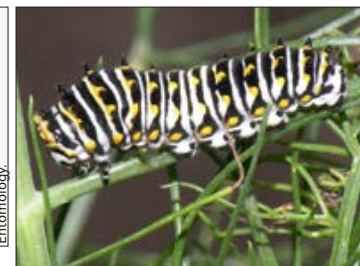
Black Swallowtail Butterfly Caterpillar ( Papilio polyxenes )