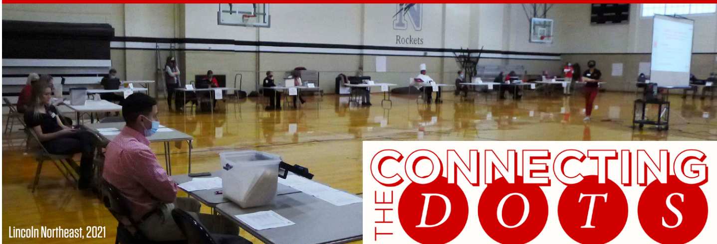
Lincoln Northeast, 2021