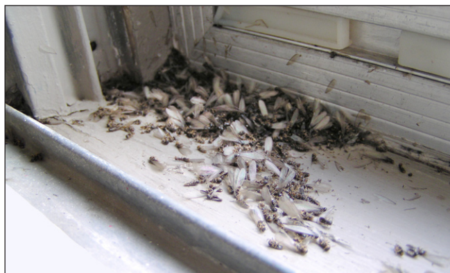
Dead termite swarmers in window sill.

of termite swarmers —small, black, winged insects that swarm in the spring. Even years after the swarm, wings may be found in cobwebs or in areas not cleaned very often. If evidence of swarmers is found inside, it is likely that worker termites are present, because swarmers emerge from mud tubes made by workers.