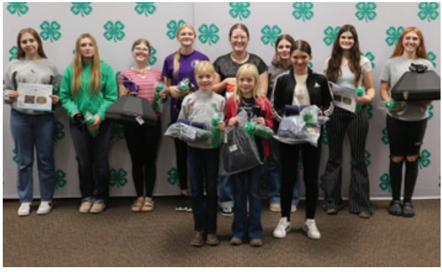
Horse Incentive Awards – Gold Level recipients