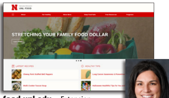
food.unl.edu – Extension Educator Kayla Colgrove (pictured) coordinates Extension's statewide

website, which received over 2.6 million pageviews in 2023 and is one of University of Nebraska– Lincoln's top 5 domains. The website provides tips, recipes and resources to help people make healthy food choices, safely prepare food and increase physical activity.