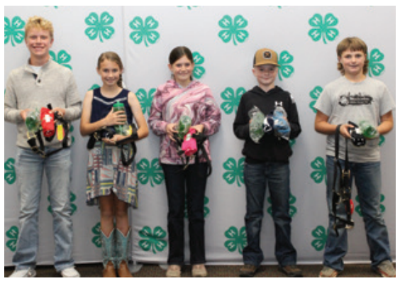
Horse Incentive Awards - Silver Level recipients