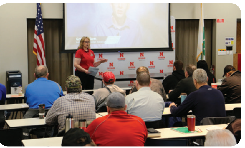
Online Self-Paced Option — Recertification Only

In-person trainings are a supplemental learning opportunity; they DO NOT replace pre-class studying of category manuals or flip charts for test preparation. Purchase study materials online at https://pested.unl.edu .