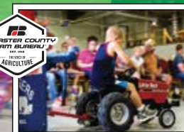
All Ages Pedal Tractor Pull FR8Star Pavilion Sun Aug 4