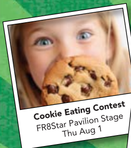
Cookie Eating Contest FR8Star Pavilion Stage Thu Aug 1

Registration info for each at SuperFair.org