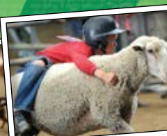
Mutton Bustin TractorHouse Pavilion Amy Countryman Arena Tue Aug 6