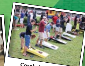
Cornhole Tourney FR8Star Pavilion Fri/Sat Aug 9 & 10