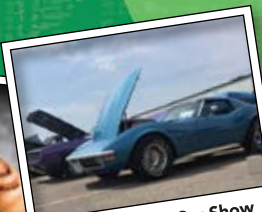
Show N Shine Car Show Parking Lot E Sun Aug 4