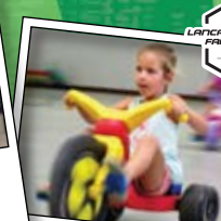
Kids Big Wheel Race FR8Star Pavilion Sun Aug 4