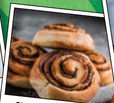
Cinnamon Roll Contest Attraction Zone Shade Tent Sat Aug 10