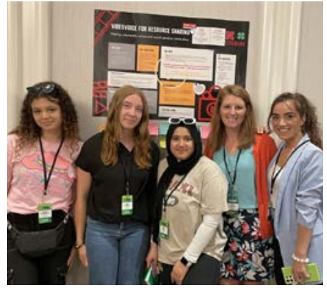
Videovoice Health Equity Project leaders posed in front of their project poster presented at the national True Leaders in Equity Institute.

TLEI is a training and leadership opportunity that challenges participants to craft and champion equity-related projects that grow 4-H in their communities. At the event, the Nebraska youth were delighted to hear from a lineup of speakers as diverse as they are. They took initiative to connect with the speakers