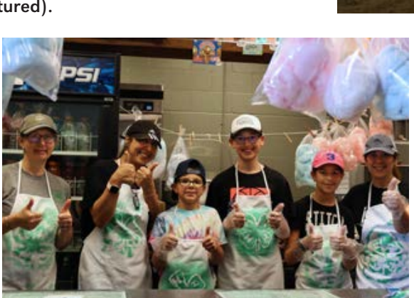
Nearly 200 4-H youth and adults volunteered at the 4-H food stand this year, which is 4-H Council's primary fundraiser. Proceeds support the 4-H program throughout the year. Youth also learn skills such as responsibility and handling food safely.

Pictured is judging of Modern Game Bantams.