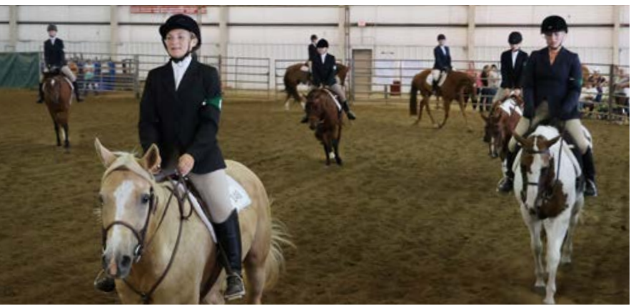
Lancaster County has the largest 4-H county fair horse show in the state, with 41 events spanning 5 days. This year, 89 horse exhibitors competed in 1,012 total entries. Pictured is the English Horse show in which English attire and tack are used.