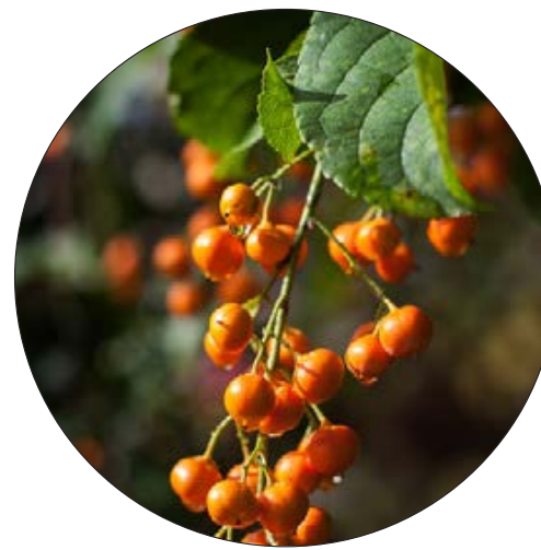
'Autumn Revolution' bittersweet unripened fruit clusters.

Bittersweet berries are a beautiful fall decoration, and gardeners may think growing their own is a great idea. But bittersweet is a fast-growing vine, which can easily get out of control. Vines twine and climb over shrubs and up nearby trees, which can severely damage or kill them. It's a poor choice for a finished area of an urban landscape, but it does make sense for wild areas, acreages or farms with a back fence, rock pile, old windmill or declining tree where it can scramble. Or, for a smaller in-town landscape, it could be planted in a whiskey barrel or other container to control its growth — just provide a trellis for it to climb.