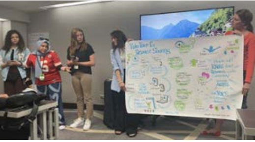
The True Leaders in Equity team presented their project idea to other Institute attendees with the aid of a video story board created by Visual-Logic.

All health inequity videos will be linked to various solutions, either as they happened or potential future solutions based on existing or needed community