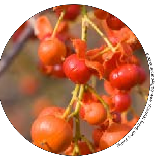
'Autumn Revolution' bittersweet ripened berries (close up).

When purchasing bittersweet, make sure you know what species you are buying! A related species, Oriental bittersweet, C. orbiculatus , is considered a priority species by the Nebraska Invasive Species Program. This means it is a top priority for eradication of new or existing populations so it does not become a noxious weed, as it is considered in