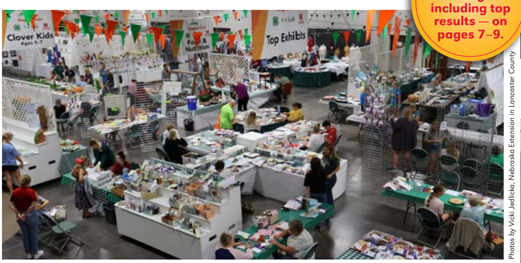
323 4-H exhibitors entered 2,435 static exhibits. The Super Fair features the largest county 4-H static exhibit display in Nebraska. Numerous volunteers work behind-the-scenes to organize and display the exhibits, as well as track ribbons. The day before the fair opens, static exhibits are judged and youth talk to judges about their projects (pictured).

The 2023 Lancaster County Super Fair was held Aug. 2-8 at the Lancaster Event Center Fairgrounds. 4-H & FFA is a big part of the first weekend of the fair, giving youth an opportunity to showcase projects they've worked on throughout the year. The Nebraska Extension 4-H youth development program offers youth ages 5-18 a variety of hands-on learning experiences. At this year's Super Fair, 496 4-H/FFA exhibitors entered 4,880 exhibits (including static exhibits, Clover Kids, animals and See more contest entries). Lancaster County 4-H thanks all the volunteers and Super Fair 4-H sponsors who make 4-H youth learning experiences possible!