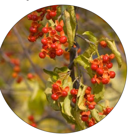
'Autumn Revolution' bittersweet ripened berries.

American bittersweet and Oriental bittersweet can be identified by their fruit clusters. American bittersweet clusters are fewer in number but larger, often 2–4 inches in length, and develop at the tip of each vine. Oriental bittersweet produces more fruit clusters, but they are smaller and develop at the junction where a leaf attaches to the main stem. Thus, each Oriental bittersweet vine may have several small fruit clusters scattered along the end of each vine.