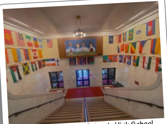
Flags in the stairwell of Lincoln High School captured by a Photovoice participant to emphasize diversity and acceptance.

Nebraska Extension recruited immigrant and refugee (I/R) youth to become Master Health Volunteers, which eventually led to