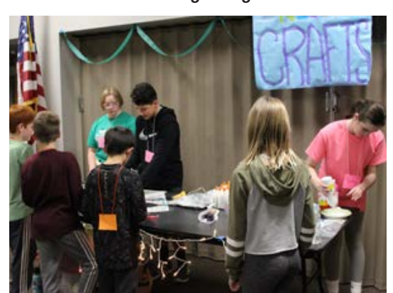
Lock-In participants had fun making neon clothespin caterpillars, neon painted pet rocks and neon friendship bracelets during the crafts session.

friends, slept a little and had lots of fun! More photos are at www.flickr.com/photos/ unlextlanco/albums. Here's what two of the teens said about this year's 4-H Lock-In.