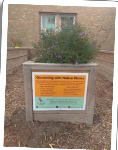
Photo of a raised garden bed with a sign description of native plants captured by a Photovoice participant as a metaphor for being "native" to a country.

Conversely, a participant reflected on the impacts of being "non-native" to a country and the mental health impacts of feeling unaccepted. "I took this photo mainly because of the text, 'native plants.' (See photo below.) It correlates