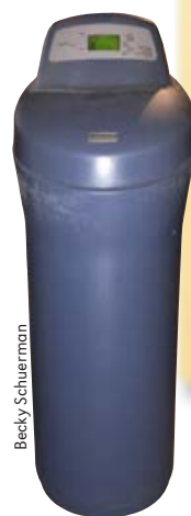
An example of a residential water softener.

When looking to install a water softener, one should make sure that the unit meets NSF/ANSI 44 technical requirements. This approval means the unit has been rigorously tested and meets the public health compliance standards for residential water softeners that use ion exchange resin, regenerated with a sodium or potassium chloride product to reduce the hardness of water from a private well or public water supply. One can contact a reputable water