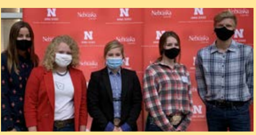
Lancaster County 4-H Livestock Judging Senior Team

In September, the Nebraska 4-H statewide Premier Animal Science Events (PASE) was held at University of Nebraska-