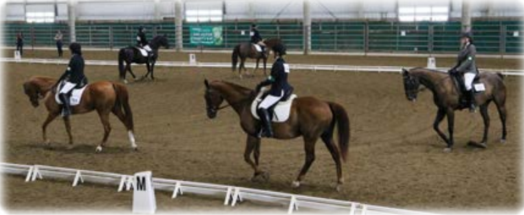
Lancaster County has the largest county fair 4-H horse show in the state