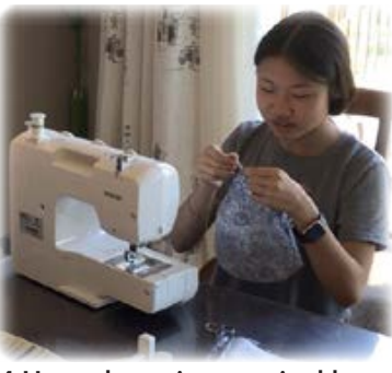
4-H youth sewing surgical hats

the "Sewing for Hospitals" phase, volunteers gave over 352 hours constructing 1,011 cotton face coverings. Due to a continued need for face coverings, a third phase resulted in an additional 700 cotton face coverings being sewn by volunteers who spent over 90 hours making the items.