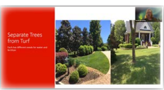
GROBigRed program on Tree Care