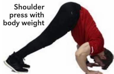
Shoulder press with body weight