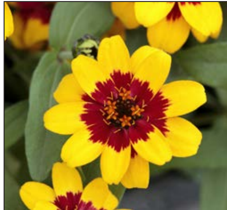
Zinnia, Profusion Red Yellow Bicolor