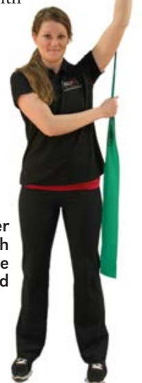
Shoulder press with resistance band