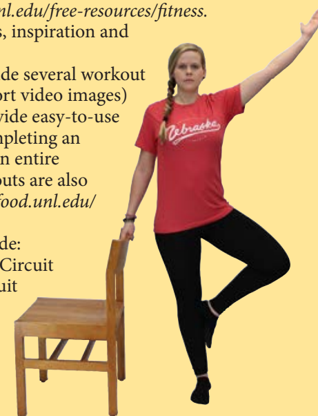
Chair yoga – tree pose