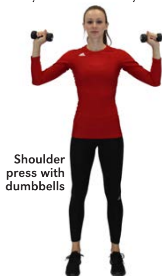
Shoulder press with dumbbells