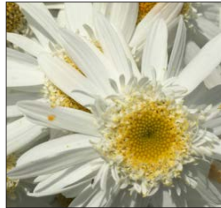
Leucanthemum, Sweet Daisy Birdy