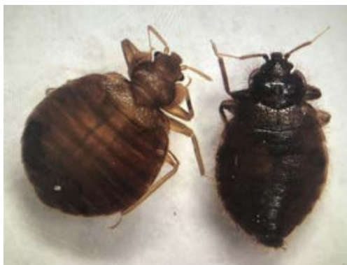
Bed bug (left) and bat bug (right)

Your mind starts to race with what you need to do: squish the bug, call a pest control company, throw out your mattress, etc. Well, I'm here to tell you, you don't need to panic! In fact, there is a good chance the insect you're seeing may not be a bed bug at all, it could be a bat bug .