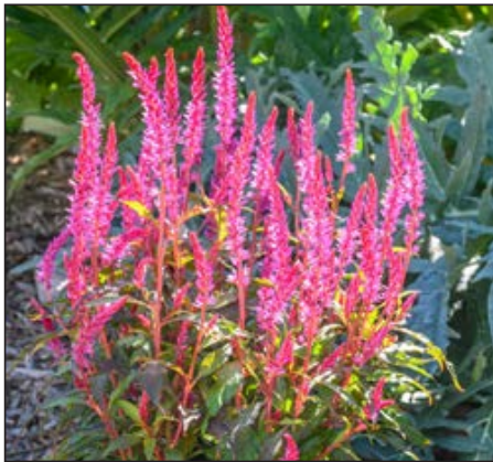
Celosia, Candela Pink