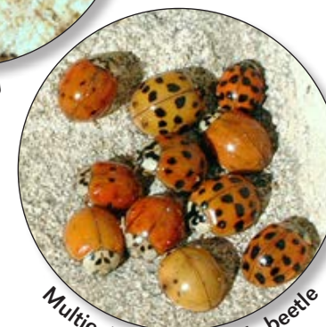
Multicolored Asian lady beetle