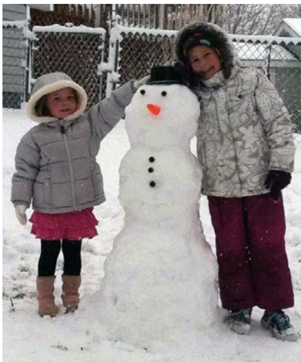
Use caution when the air temperature is between 11°F and 39°F.

First of all, we need to inform parents and caregivers about our intentions when it comes to outdoor play including the time frame and temperature. This is best done at the time of enrollment. It is wonderful to have an outdoor play policy included in the child care hand-