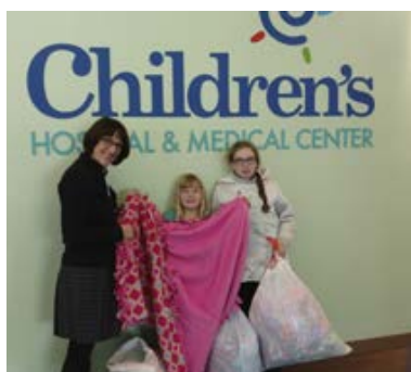
Five Star 4-H’ers made 8 fleece tied blankets for the Children’s Hospital and Medical Center in Omaha.