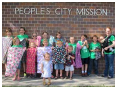
JP2 Crew sewed 16 pillowcases for the People’s City Mission.