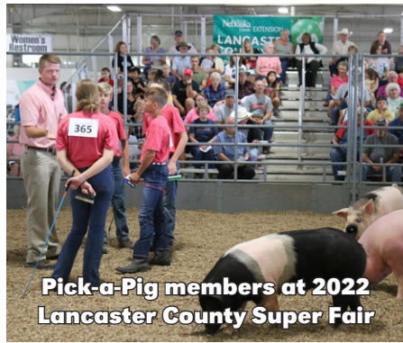
Pick-a-Pig members at 2022 Lancaster County Super Fair

The Pick-A-Pig 4-H club is for anyone who wants to learn about raising livestock and show a pig at the Lancaster County Super Fair. The club is open to all city and rural youth ages 8–18. Youth ages 10 and up are preferred. Pigs are provided and kept at a local farm. Due to current