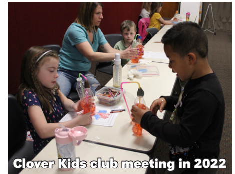
Clover Kids club meeting in 2022