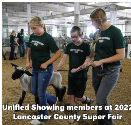
Unified Showing members at 2022 Lancaster County Super Fair