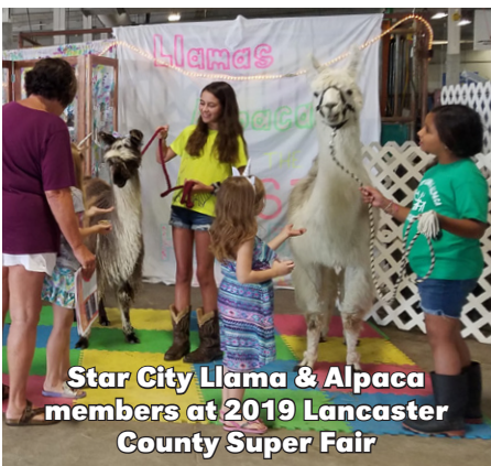
Star City Llama & Alpaca members at 2019 Lancaster County Super Fair