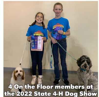
4 On the Floor members at the 2022 State 4-H Dog Show

The 4 On the Floor dog 4-H club for youth ages 9–18 will start on Monday, Jan. 9, 2023 at the Lancaster Event Center Fairgrounds – 4-H office located by Pavilion 3. Meetings will be held every other Monday at 6:15 p.m. and last about an hour. Summer schedule (after May) to be determined. The 4-H dog project is fun and fulfilling. Training a dog is a lifelong skill! Youth should be able to maintain general control of their dog, and their dog should not show