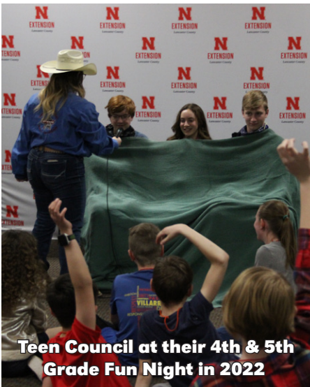
Teen Council at their 4th & 5th Grade Fun Night in 2022

Several Lancaster County specialty 4-H clubs are looking for new 4-H members. Current 4-H members and those interested in joining 4-H are invited to join these clubs.