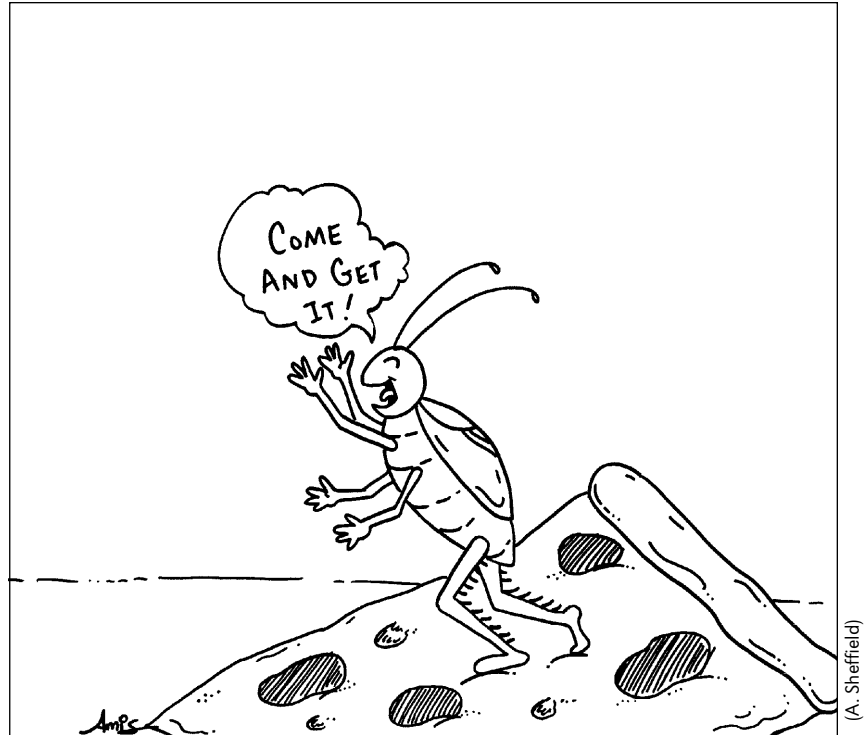
Figure 4-3. A single slice of pizza, left on the counter overnight is a feast for cockroaches.

In apartments, the cockroaches may have first entered from outside or from adjoining units. You should check possible entry points such as around water and drain pipes under the sinks, sewer pipes,