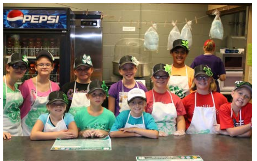
More than 200 4-H youth and adults volunteered at the 4-H food stand this year, which is 4-H Council's primary fundraiser. Proceeds support the 4-H program throughout the year. Pictured is the Clever Clovers club.