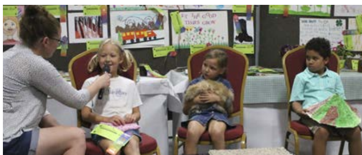
Many 4-H Clover Kids (ages 5–7) entered exhibits and participated in Show & Tell, earning participation ribbons.