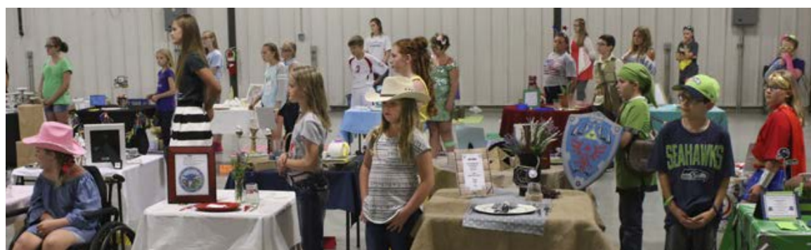
The Table Setting Contest is one of several 4-H contests held at the fair. Some contests, such as Presentations and Bicycle Safety, are held prior to the fair.