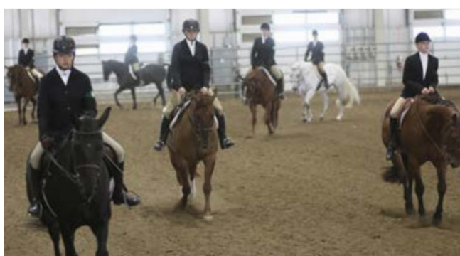
Lancaster County has the largest 4-H county fair horse show in the state, with 41 events spanning seven days. This year, 123 horse exhibitors competed in 1,076 total entries. Pictured is English Pleasure.