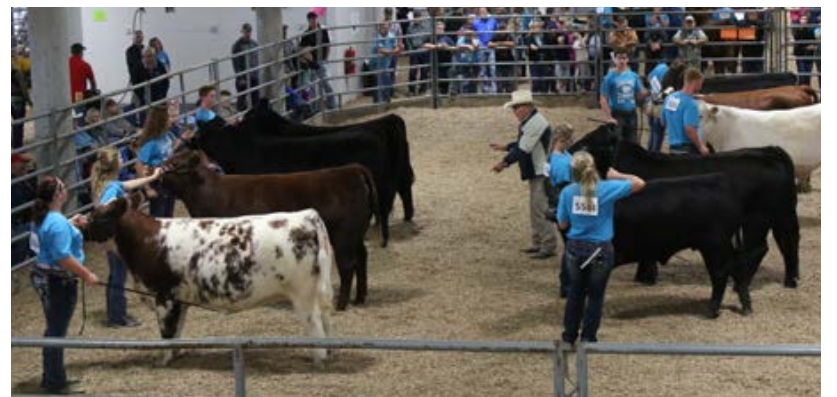
In livestock showmanship classes, youth are judged on their ability to handle and present their animal.