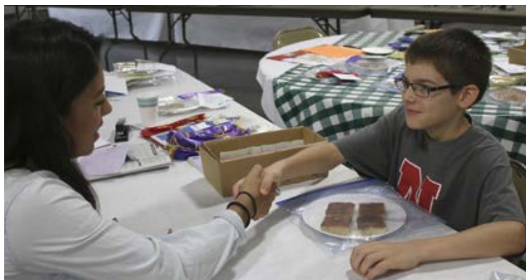
Nearly 500 4-H/FFA exhibitors entered a total 2,498 static exhibits. The Super Fair features one of the largest county 4-H static exhibit displays in Nebraska. Pictured is a food and nutrition project being interviewed.

See page 7 for top results. Go to http://lancaster.unl.edu/4h/fair for complete 4-H results, photos and videos.