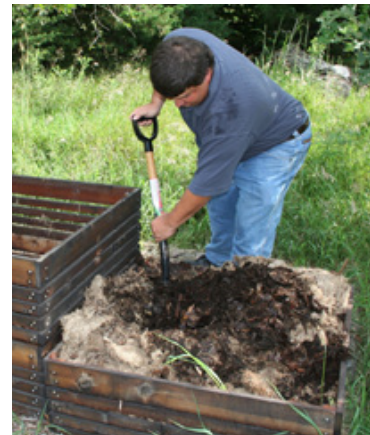
Extension presented nine composting workshops and demonstrations.

UNL Extension plays a vital role in teaching communities horticulture issues designed for local weather, water, soil, and pest conditions. Extension helps property owners develop healthy, diverse and functional landscapes that are energy and water efficient, as well as less dependant on pesticides.