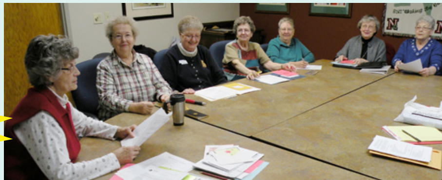
Five FCE & Community Leader Trainings were held in 2010.

The Family and Community Education (FCE) clubs are an educational, social, and community-oriented program designed to meet the needs and interests of Nebraska homemakers. FCE members help strengthen communities and families through education, leadership, and action. Lancaster County FCE's emphasis is on community service and sponsoring a scholarship. Annually, FCE awards a $400 scholarship.