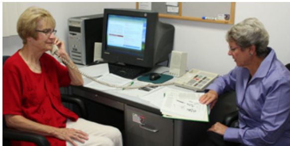
28 Lancaster County Master Gardener volunteers logged 1,189 hours this year.