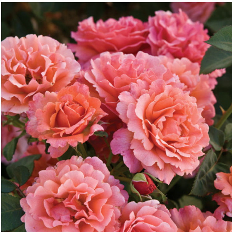
'Easy Does It' rose.

There is only one winner this year, called 'Easy Does It', but it is quite an amazing rose. This rose is a floribunda and has a bushy, rounded habit. It has a double ruffled flower with beautiful mango orange, peach-pink and apricot colors. The shades of sunset show up in fragrant, large colorful clusters of blooms that top the glossy green foliage. This rose is disease resistant and vigorous. You will want to consider it for your rose garden or landscape.