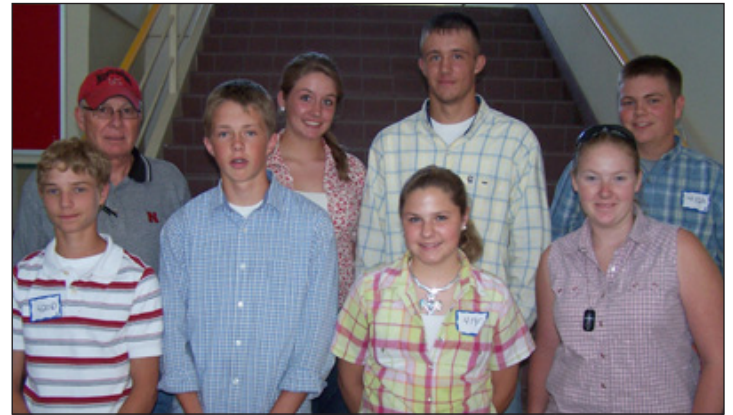
Lancaster County participants at Livestock Judging during the Premiere Animal Science Events (PASE).