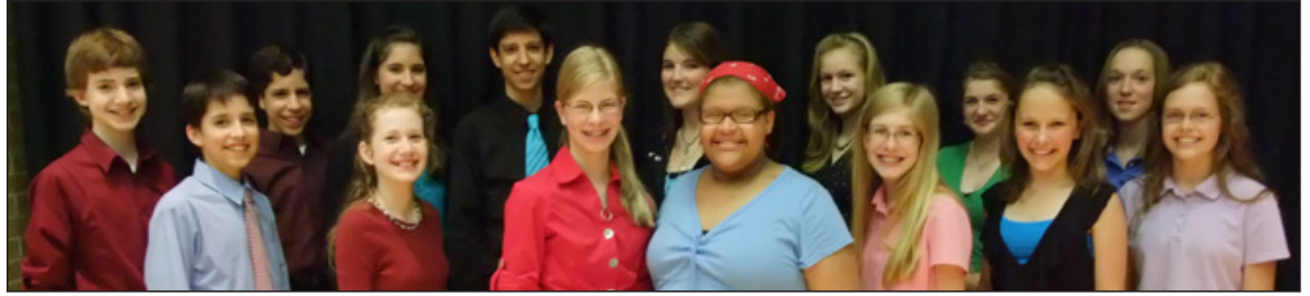
Lancaster County participants at state 4-H Life Challenge.

The 4-H Life Challenge contests focus on Family and Consumer Science project areas. Youth answer written questions and give an oral presentation applying what they have learned in their 4-H projects to a real-life situation.