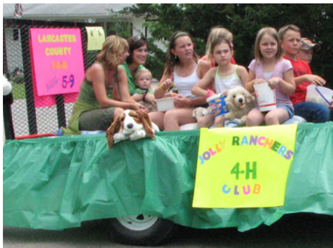
The Jolly Ranchers 4-H club had a float in the Eagle Fun Days Parade which was on July 11.