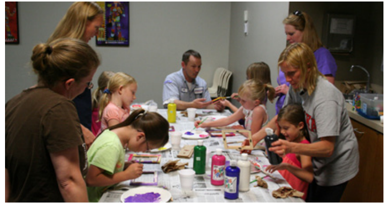
The Helping Hearts 4-H club was formed this year.

Club officers — Youth members choose officers to run their meetings.