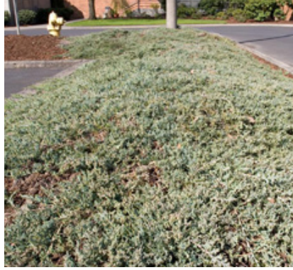
Blue Rug Creeping Juniper Scientific name: Juniperus horizontalis 'Wiltonii'