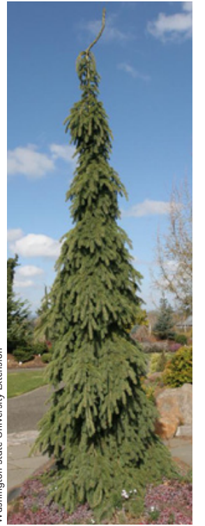
Weeping White Spruce Scientific name: Picea glauca 'Pendula'