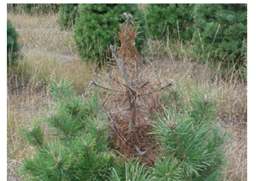
Winter burn (freeze damage) on conifers.

Often, a combination of winter burn and winter drying will occur, occasionally complicated by drought. If damage is severe enough, affected branches may die.