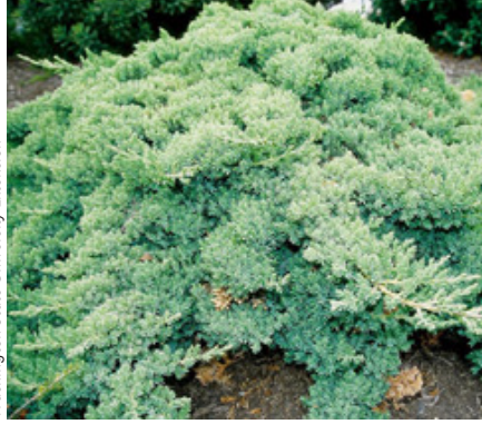
Dwarf Japanese Garden Juniper Scientific name: Juniperus procumbens 'Nana'