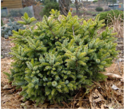
Dwarf Serbian spruce Scientific name: Picea omorika 'nana'