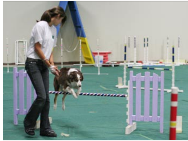
The Lancaster County 4-H dog club, Canine Companions, was a recipient of the 2008 Governor's Agricultural Excellence Awards. These funds were matched by the Lancaster County Agricultural Society to purchase new dog agility equipment.