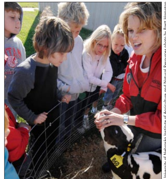
At Ag Awareness Festival, fourth graders rotate between interactive stations such as Dairy Calves, Ruminant Nutrition and Farm Technology.