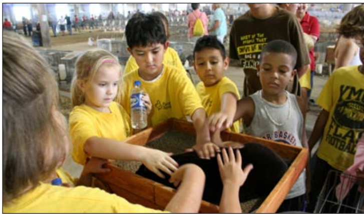
Lancaster 4-H partnered with many after-school summer sites to provide a county fair-related curriculum with hands-on activities which could be done before the Lancaster County Fair. The groups were then invited to experience the fair hands-on.