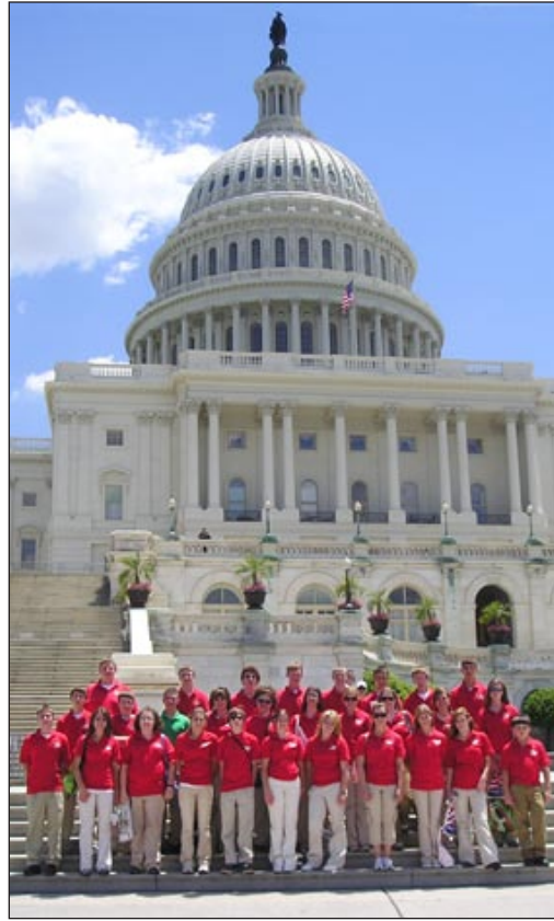
In June, the Lancaster County 4-H Citizenship Washington Focus (CWF) group—33 teens and 4 sponsors—traveled by bus on a 15-day itinerary to Washington D.C. CWF is a citizenship and leadership program.