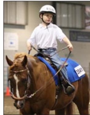
This was the second year a Special Needs Horse Show was held at the Lancaster County Fair.