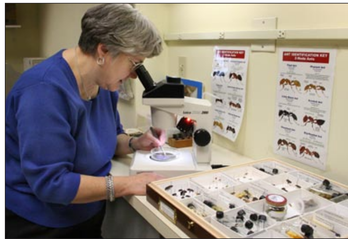
UNL Extension in Lancaster County has a lab for diagnostic services.