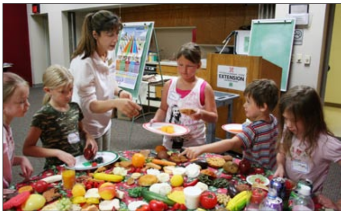
The Nutrition Education Program teaches nutrition to youth, adults and seniors.

Education Program (NEP) helps limited-resource families learn to prepare nutritious and safe foods while stretching their food dollars. NEP receives funding from the Expanded Food and Nutrition Education Program (EFNEP) through USDA and the Supplemental Nutrition Assistance Program—Education (SNAP-Ed). NEP partners with more than 300 local agencies, classrooms and coalitions.