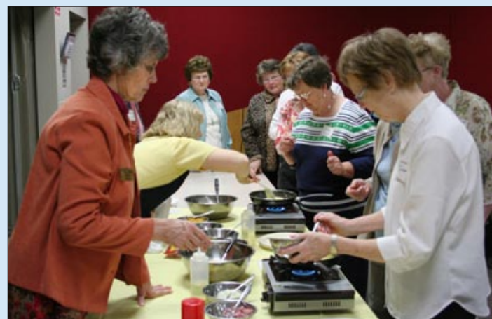
In April 2008, the Southeast District FCE meeting was held at the Lancaster Extension Education Center.

The Family and Community Education (FCE) clubs are an educational, social and community-oriented program designed to meet the needs and interests of Nebraska homemakers. FCE members help strengthen communities and families through education, leadership and action. Lancaster County FCE's emphasis is on community service and sponsoring a nursing scholarship. In the past 10 years, FCE has awarded $2,375 in total scholarships.