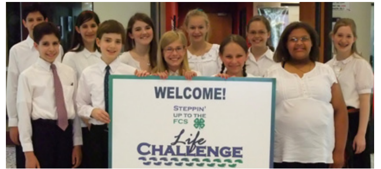
Lancaster County 4-H'ers who participated in the state Life Challenge for seniors.

The state Life Challenge contest for seniors was held at UNL