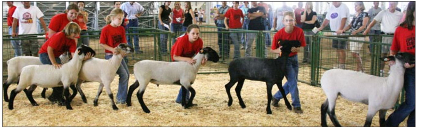
4-H'ers showcased their market lambs to the judge and the public. This year's largest livestock classes were the junior divisions (youth ages 8–10).

Complete 4-H ribbon results, many more photographs and some videos are online at http://lancaster.unl.edu