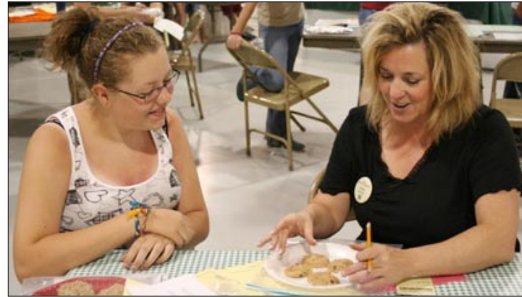
In Interview Judging, 4-H'ers had the opportunity to talk with a judge about their static exhibits, what they learned and how to improve skills.