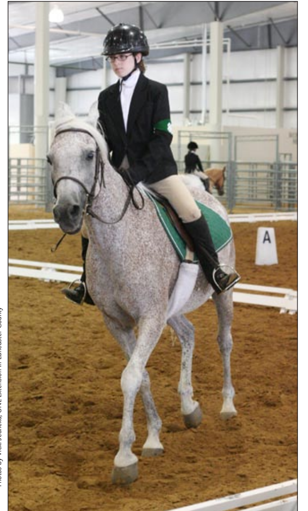
The 4-H Horse Dressage Show was held in the new Pavilion 3 large arena.