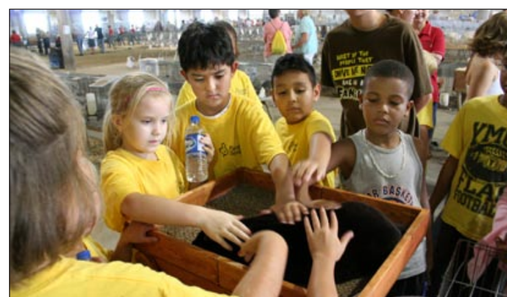
Lancaster 4-H partnered with many afterschool summer sites to provide a county fair-related curriculum with hands-on activities which could be done before the fair. The groups were then invited to tour the county fair.