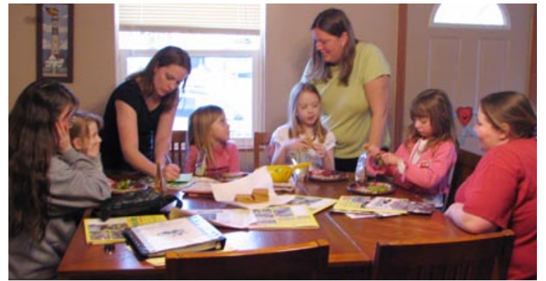
The Smiley Do Rights 4-H club started this year.

Club officers — Youth members choose officers to run their meetings.