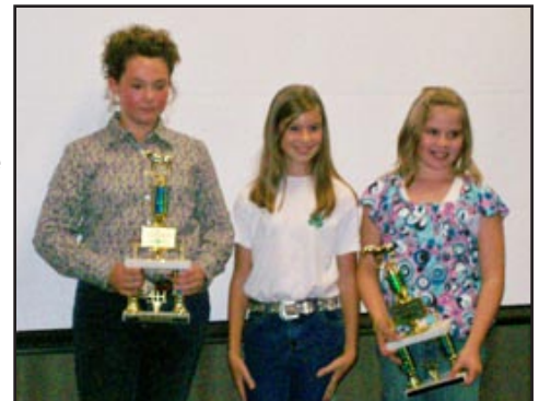
Horse Course Challenge Elementary winners