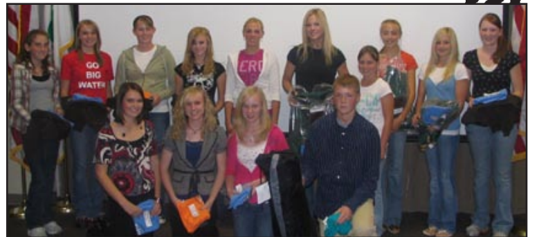
Horse Incentive, Gold Level award winners