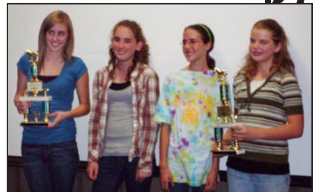
Horse Course Challenge Junior/Senior winners