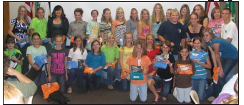
Horse Incentive, Silver Level award winners