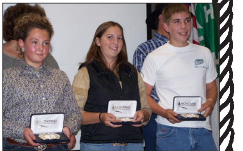
All-Around Cowboy/Cowgirl award winners