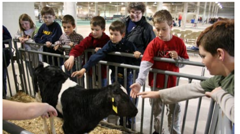
Youth take a hands-on approach to learning about dairy calves.

The Ag Awareness Coalition, led by University of Nebraska—Lincoln Extension, organizes the festival with the help of agriculture businesses, commodity associations and food industry companies. This is the seventh year the festival has been held in Lincoln.