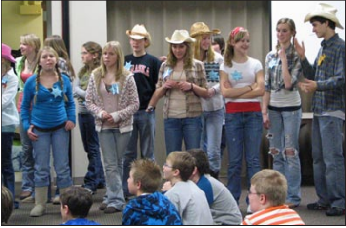
On Jan. 25, nearly 30 4-H Teen Council members organized and led the 4-H Overnight Lock-In for more than 80 fourth & fifth graders.

The Lancaster County 4-H Teen Council is a leadership organization for youth in grades 7–12. Members are involved in several leadership activities such as organizing the annual 4th & 5th Grade Lock-In and the Ice Cream Social at the Lancaster County Fair. Teens also participate in community service projects.