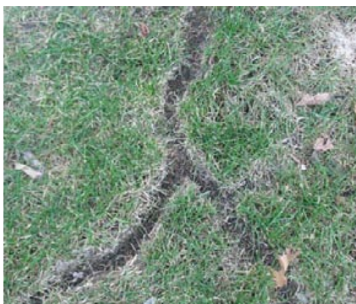
Surface runway system of the prairie vole.

If you discover voles, it doesn't mean you have major damage to your plants. Before you decide to control voles, consider the extent of the problem in relation to the cost of control. For example, a few voles could damage a highly valued tree or flower bed and warrant