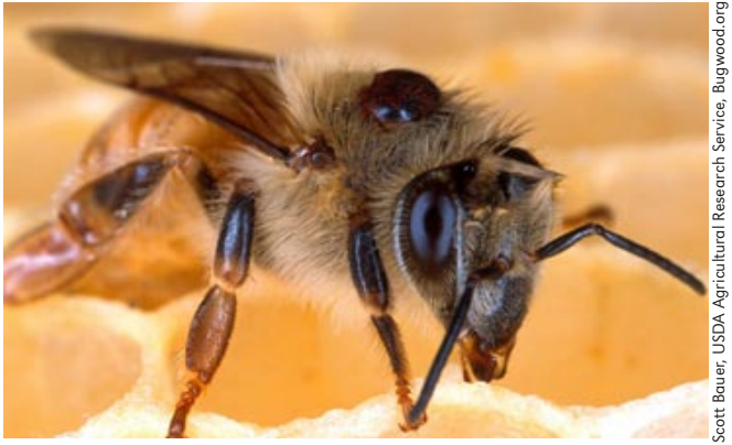
European honey bee with a varroa mite on its back. Israeli acute paralysis virus (IAPV) can be transmitted by the varroa mite.

Because honey bees are responsible for pollinating berries, fruits and vegetables valued at $15 billion, bee researchers mobilized and started working together to discover the cause(s) of CCD. Some of the theories included: • Pesticides having unexpected negative effects on honey bees. • A new parasite or pathogen may be attacking honey bees. • Existing stresses may have unexpectedly weakened colonies leading to collapse. These