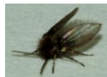
Highly magnified view of adult drain fly.

breeding area, which usually means cleaning the inside of the pipes to get rid of the goo that lines the pipes. There are several common mistakes people make in their attempt to control drain flies. Bleach and drain uncloggers will not penetrate and dissolve the gelatinous material which