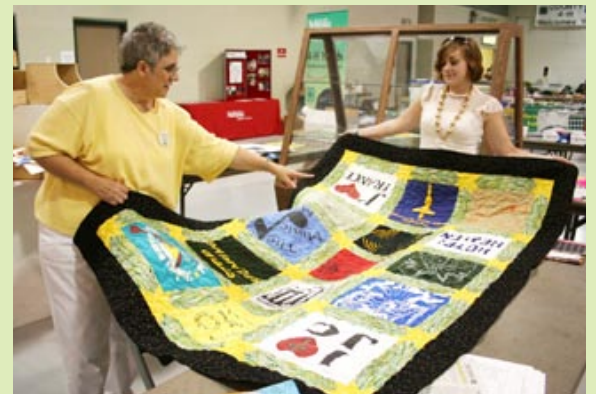
A 4-H member discusses her quilt project with a judge at the Lancaster County Fair.

Nebraska 4-H recently worked in conjunction with the International Quilt Study Center and the UNL Department of Computer Science and Engineering to produce an exciting, new quilting curriculum. "Quilt Quest" combines technology, textile design, history, communication and more to create a fun, meaningful and interactive project for youth. To learn more about the 4-H Quilt Quest project, go to http://4h.unl.edu/programs/curriculum/quilt.htm or contact UNL Extension in Lancaster County at 441-7180. You can download a 4-H Quilt Block Design at http://www.quiltquest.unl.edu