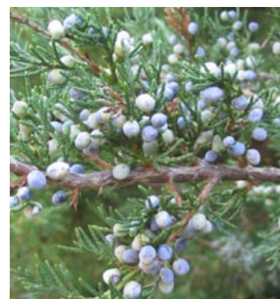
Eastern red cedar berries