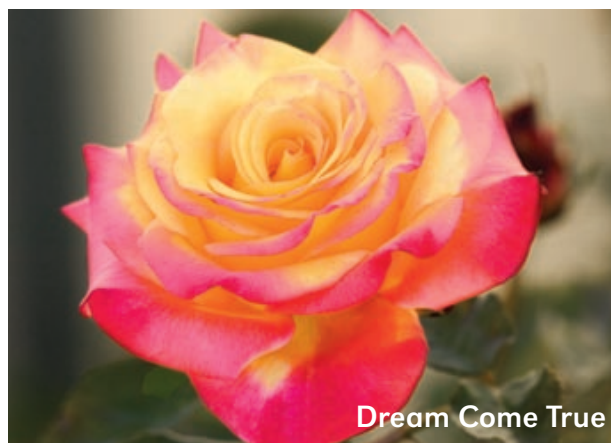
Dream Come True