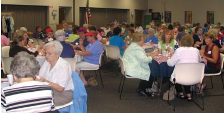
The evening started with a light supper.

The Family & Community Education (FCE) Sizzling Summer Sampler held on July 10 was a success with 115 FCE members and friends in attendance.