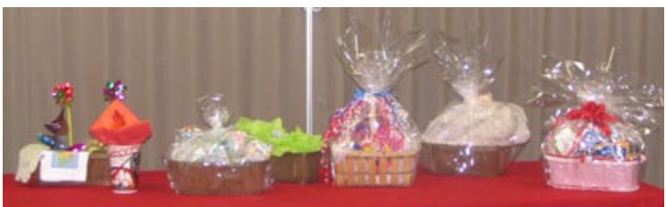
Fifteen baskets were raffled off, raising $391 for the FCE Scholarship Fund.