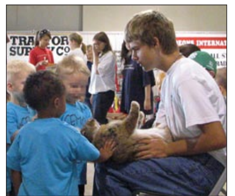
Animal exhibitors are encouraged to share knowledge about their animals.

4-H Council also raises funds to support 4-H programs, activities and scholarships. The majority of 4-H Council’s fundraising comes from staffing a 4-H snack booth at the Lancaster County Fair (the 4-H Corner Stop is located near the main entrance). Many 4-H clubs staff a shift at the snack booth. At least one 4-H Council member (youth or adult) is at the booth at all times.