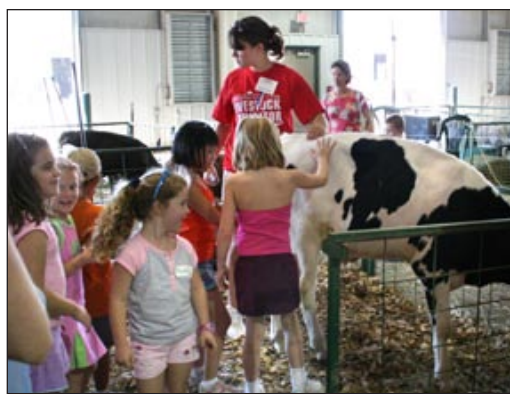
Teens act as tour guides for child care groups during Fair Fun Day.