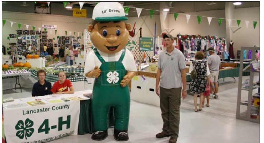
4-H Teen Council members staff the 4-H Information Table at the Lancaster County Fair.