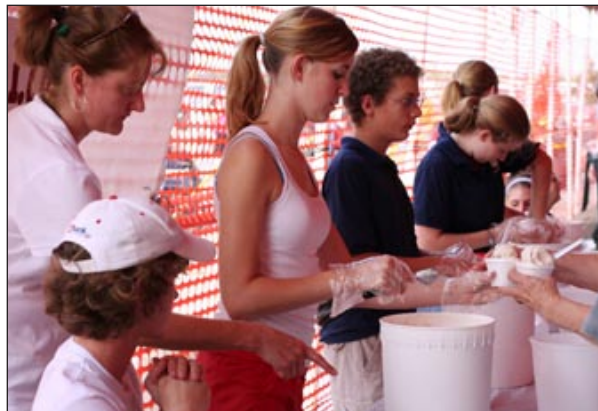
Each year, 4-H Teen Council organizes an Ice Cream Social as a fundraiser for their program.

Lancaster County 4-H Council is responsible for determining long- and short-term goals and policy for Lancaster County 4-H. Comprised of adults and youth, the 4-H Council is a partnership between adults and youth who make decisions and work together.