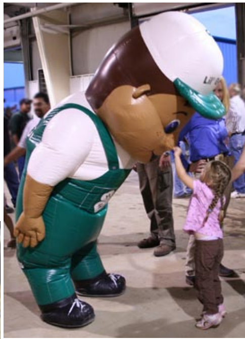
Lil' Green, the Nebraska 4-H mascot, made his first appearance at the Lancaster County Fair (he debuted at the Nebraska State Fair last fall).