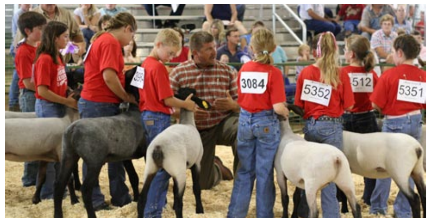
In animal showmanship classes, 4-H members demonstrated their ability to handle their animals, plus answered questions about their animals and the livestock industry.