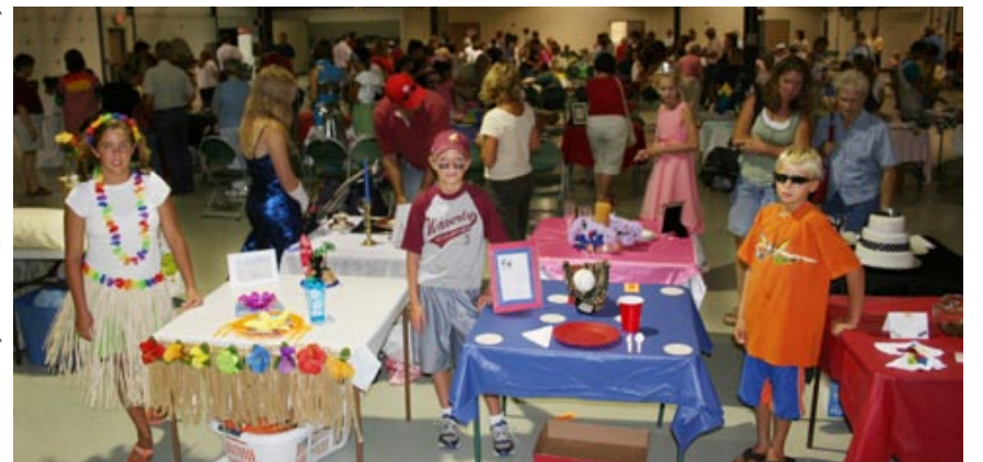
Youth participating in the 4-H Table Setting Contest learned how to properly set a table, plan nutritious meals, express creativity and present to a judge.