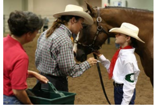
Elementary division youth (ages 8-11) displayed their knowledge of caring for horses in the 4-H Groom and Care Horse Show. The judge interacted with each exhibitor one-on-one.