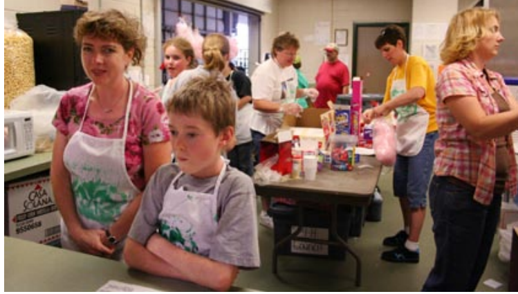
The 4-H Corner Stop food booth was staffed largely by 4-H clubs volunteering as groups. The food booth is 4-H Council's primary fundraiser — proceeds benefit 4-H programs, scholarships and activities. Youth learn skills such as responsibility and social skills.

Complete 4-H ribbon results and more photographs are online at http://lancaster.unl.edu/4h/Fair