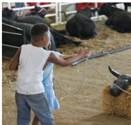
As part of Fair Fun Day for child care groups, members of the Lonestar 4-H club taught younger kids about bucket calves, feeding cattle and roping (watch a YouTube video on the 4-H web site at http://lancaster.unl.edu/4h/Fair ).