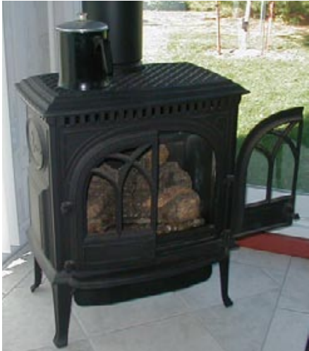
Soni Cochran, UNL Extension in Lancaster County

chimney sweep or clean the chimney flue and damp once a year with a big brush. For woodburning heaters and stove pipes, take time to clean and check for buildup and other problems or hire a chimney cleaner to do so before it gets cold.