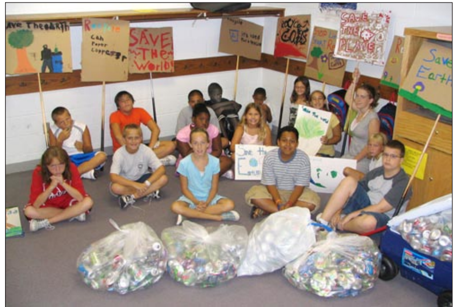
Youth at the Belmont Recreation Center Summer Day Camp collected cans as part of 4-H “Trash to Treasure.”

To help Lincoln youth learn about Reduce, Reuse, Recycle — UNL Extension in Lancaster County and the City of Lincoln Recycling office recently developed “Trash to Treasure” 4-H curriculum and kits for Lincoln after-school programs. The kits include all supplies needed for hands-on educational activities. To date, 15 after-school programs have utilized the kits.