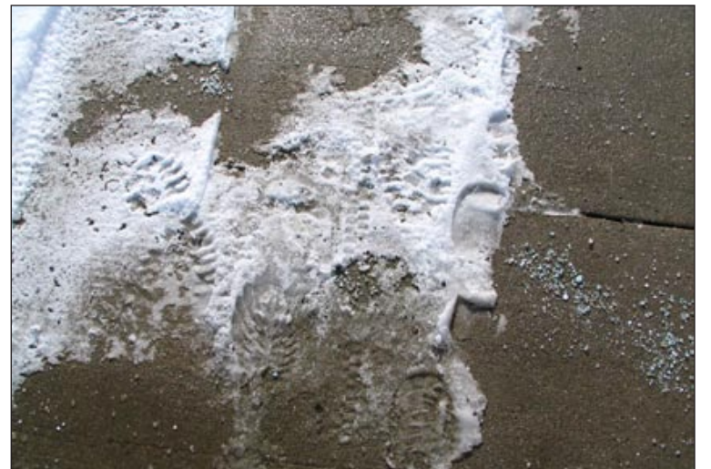
Deicers should not be used to completely melt snow or ice, but to make it easier to clear them away.

Accumulation of salt in the soil over several years may cause progressive decline and eventual