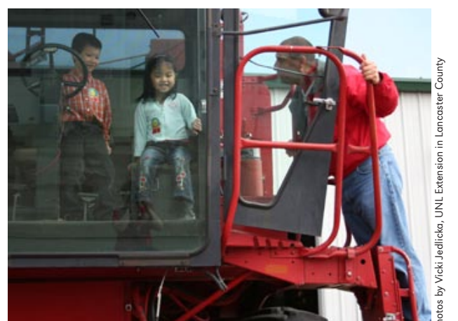
In the Farming Technology session, youth had a chance to sit in a combine cab.

One American farmer/rancher produces enough food for 129 people – 95 in the U.S. and 34 abroad.