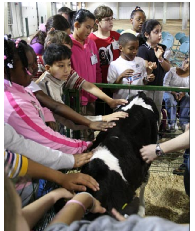
Students got a “hands-on” approach to learning about dairy production.