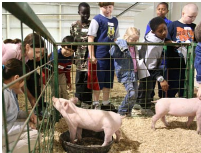
Students got a close look at two-month-old barrows (male swine).

One American farmer/rancher produces enough food for 129 people – 95 in the U.S. and 34 abroad.