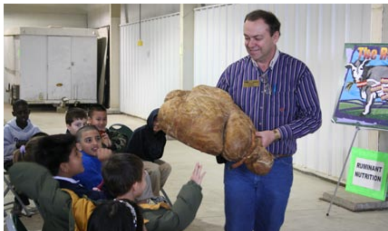
Youth saw a preserved cow stomach as they learned a ruminant digestive system has multiple stomach chambers.

The Ag Awareness Coalition, led by University of Nebraska–Lincoln Extension, organizes the festival with the help of agriculture businesses, commodity associations and food industry companies.