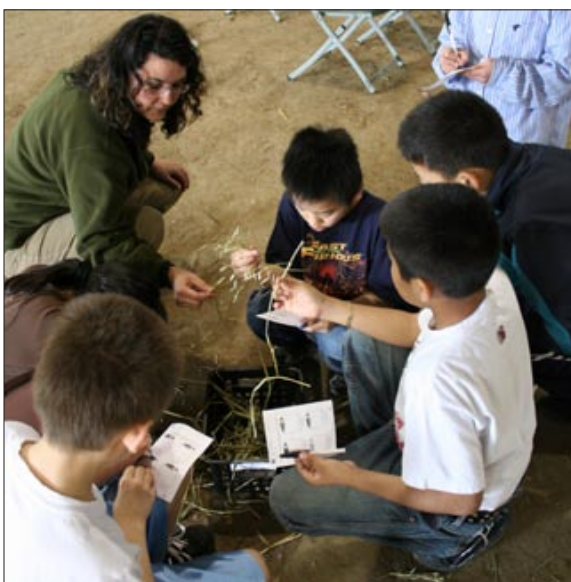
Is this timothy or alfalfa hay? Students learn the different types of forages and their uses.