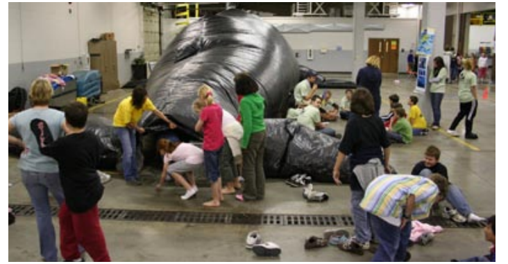
Fifth graders crawled into a 45-foot long, inflated whale during the “Whale of a Tail” session.