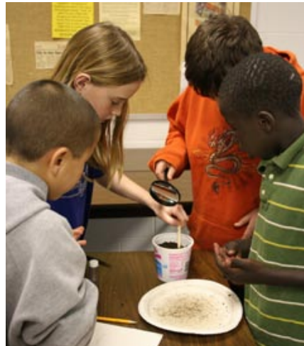
Students examined abundant animal and plant life found in dirt during the “The Secret Life of Soil” session.

Source: National Drought Mitigation Center, University of Nebraska–Lincoln