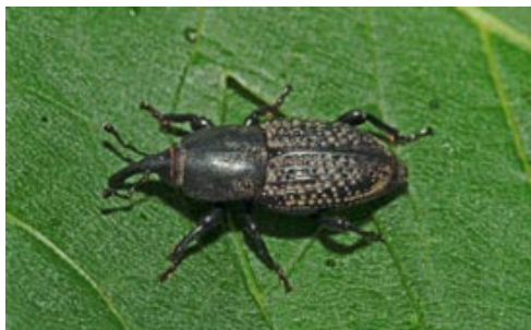
Adult Bluegrass Billbug (magnified)

If billbug damage is suspected, inspect the turfgrass crowns. Infested plants are easily pulled up and separate at the soil surface. The crown area is swollen, hollowed out and ragged with frass (a sawdust like material) present. Digging