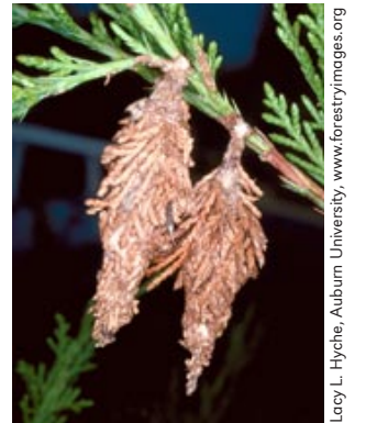
Bagworm bags at completion of larval development (pictured) are difficult to control.