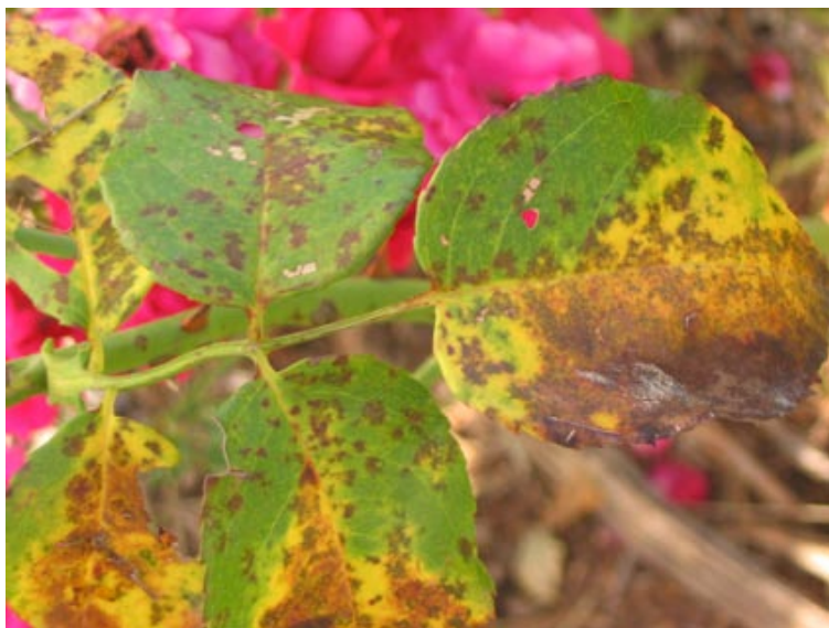
Leaves of a rose bush infected with black spot will turn yellow and develop black dots.

The only effective method used to treat an infestation is to follow a regular spray program. Even with this treatment, however, black spot will typically return in subsequent years if environmental conditions are