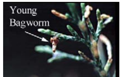
In June, bagworm larvae are susceptible to insecticides.

Bagworm eggs hatch in early June and young worms will begin to feed on junipers, cedars and arborvitae in eastern Nebraska. Bagworms also occur on various deciduous trees such as flowering crabs, plums, linden and cotoneaster. The bags attached to the trees now are those left over from last year and are empty, except for the remaining egg masses that will finish hatching. The worms are very tiny, probably 3/8-inch in length or less, and each contained inside a small protective sack or bag which they construct of silk and plant material. At this stage, the larvae are susceptible to insecticides; but after 6 weeks, they will be more difficult to control. Suggested materials are carbaryl (Sevin), permethrin (Eight) and various formulations of "BT" (Dipel, Thuricide). Follow label directions and be sure to spray trees and shrubs thoroughly to penetrate foliage. Good coverage is essential if control is to be effective.