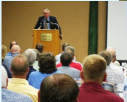
Representative Tom Osborne gave the keynote presentation.