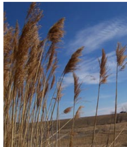
Phragmites along N. 27th Street

These three invasive plants are a threat to the wetlands, streams and riparian areas in and