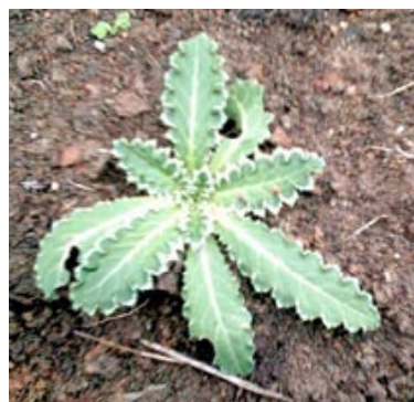
Musk thistle is easiest to kill during the rosette stage (pictured).

To successfully fight weeds, you need to know as much as possible about each weed, then develop a strategy to manage that weed. Musk thistle ( Carduus nutans ) is usually thought of as a biennial, germinating one year, usually in the fall, overwintering and flowering the next year. When there is a long enough cool period in the spring, some musk thistle plants will act as annuals by germinating in the spring and flowering in early summer. Musk thistle spreads only by seed. One seed head can produce over 1,000 seeds. The seeds can remain viable in the soil for ten years. The key to managing musk thistle is to prevent all plants from going to seed.