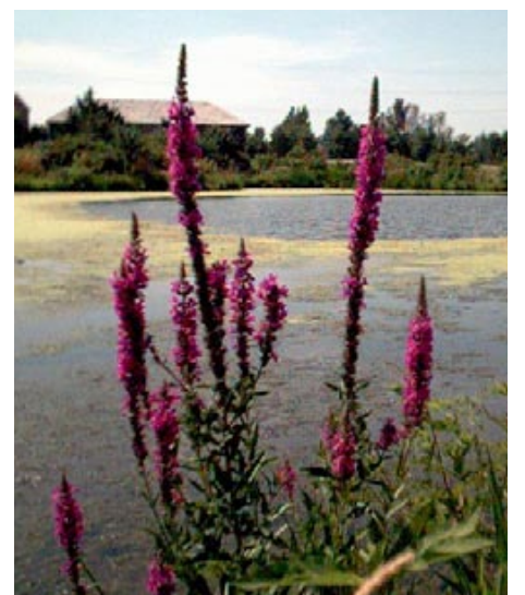
Wild infestation downstream from ornamental plantings.

Although we feel that most of the ornamental plants have been removed, a plentiful supply of seeds have been transported to low lying areas and will remain in the soil until conditions are right for them to germinate. Wild purple loosestrife plants have been