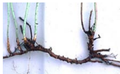
Leafy spurge extend roots deep into the ground as well as laterally.

The control of well-established leafy spurge stands must be considered a long-term management program. A landowner must develop a persistent annual program that will prevent the spread of larger stands, eliminate smaller infestations and prevent the spread of leafy spurge to uninfested areas. The extensive leafy spurge root system allows the plant to regrow from depths of 15 feet or more for several years. No single treatment will eradicate this weed, but a consistent annual treatment program can provide long-term control. Once you have achieved a high level of control, remaining isolated patches can be spot-treated, resulting in a less costly control program. This plant spreads by underground roots and there is always a fringe area of younger plants that do not bloom. There are also roots underground that extend laterally beyond the younger plants. A 15-foot perimeter should be