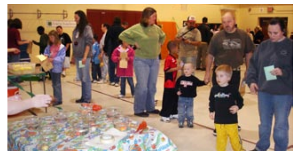
Pet Pals 4-H club led a Gold Fish ping pong toss.

Over 350 4-H families and Elliott school students and their families attended this year's Kiwanis Carnival held April 14 at Elliott Elementary School. Lincoln Center Kiwanis sponsors the free, family event by providing snacks and prizes. Eleven 4-H clubs created and ran carnival-type games for kids.