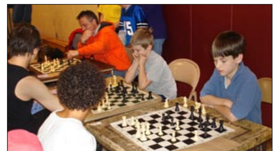
Youth played chess at The Checkmates 4-H club's booth.