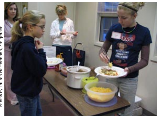
A hands-on food preparation experience expanded basic cooking skills.