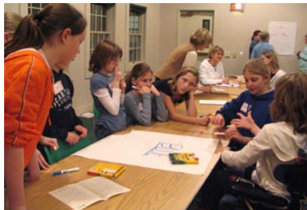
Attendees participated in a Real Colors personality assessment to learn about different personality types.