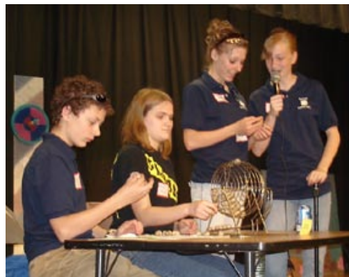
4-H Teen Council members led bingo for adults.