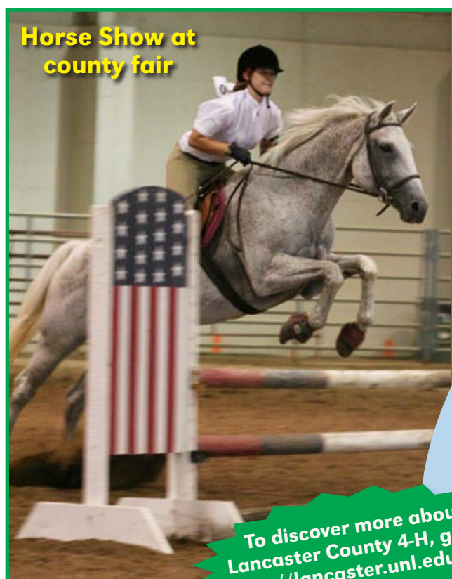
Horse Show at county fair