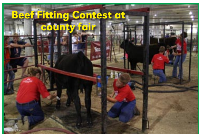
Beef Fitting Contest at county fair