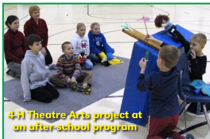
4-H Theatre Arts project at an after-school program