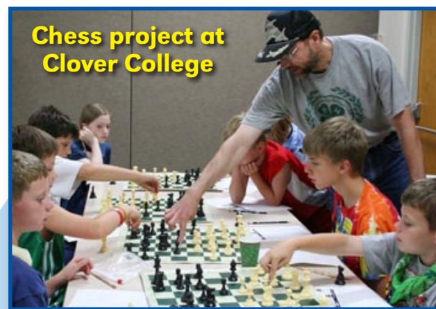
Chess project at Clover College

To discover more about Lancaster County 4-H, go to http://lancaster.unl.edu/4h