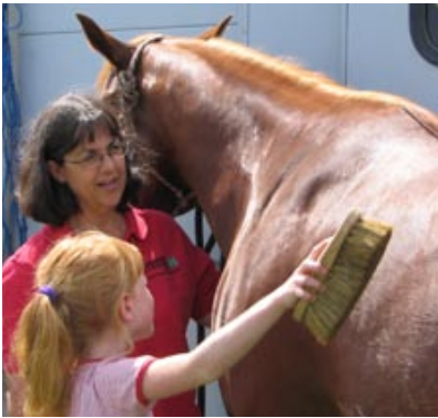
Youth got a hands-on look at how to care for horses (pictured above) and dairy goats in "Horse of Course" and "Great Goats."