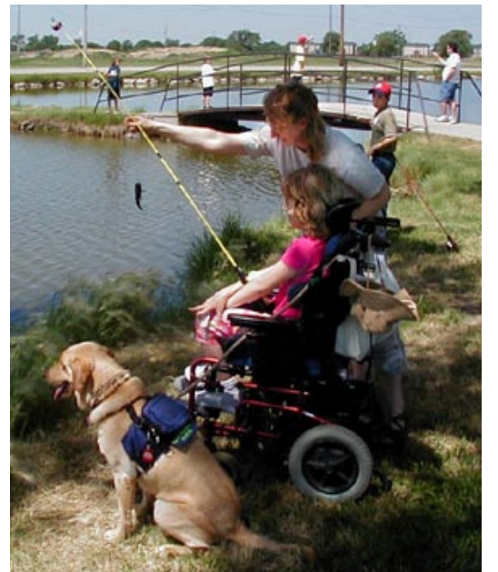
In "Fishing Fun," youth caught (and released) several bullheads and catfish at nearby Oak Lake.