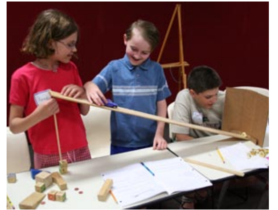
Also new, a three-day "Kids' Real Science" class put the scientific method to use with fun, hands-on experimentation. Each day had a different theme: chemistry, biology and physics.