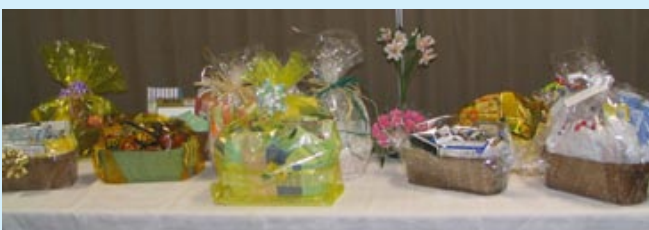
Twenty-three baskets were raffled off, raising $360 for the FCE Scholarship Fund.