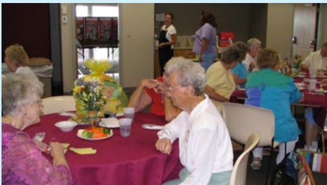
The evening started with a light supper.

The Family & Community Education (FCE) Sizzling Summer Sampler held on July 10 was a success with nearly 100 FCE members and friends in attendance.