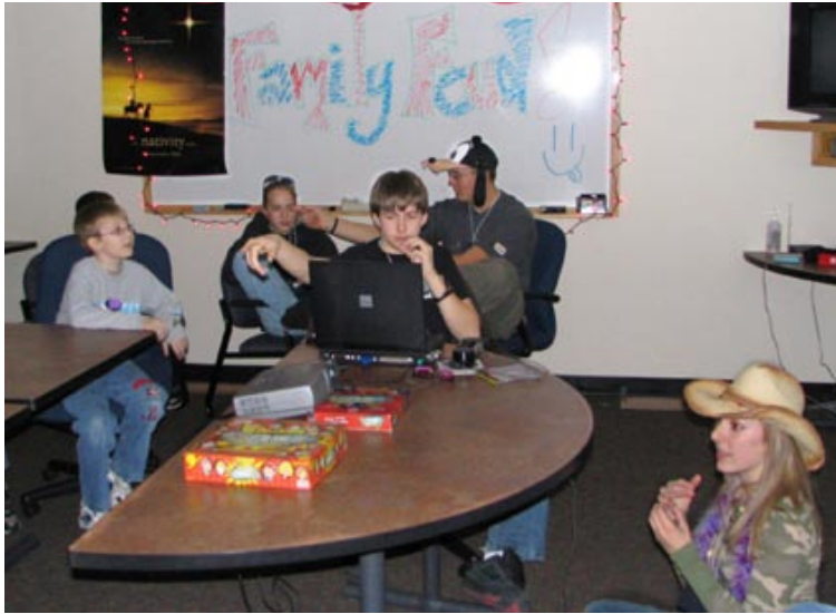
4-H Teen Council members organized and led all Lock-In activities, including the game room where Family Feud and charades were played.

The evening consisted of a variety of fun and entertaining activities beginning with icebreaker games. The children created their own movies, written, directed and played by themselves. The scripts ran from talent shows to fashion