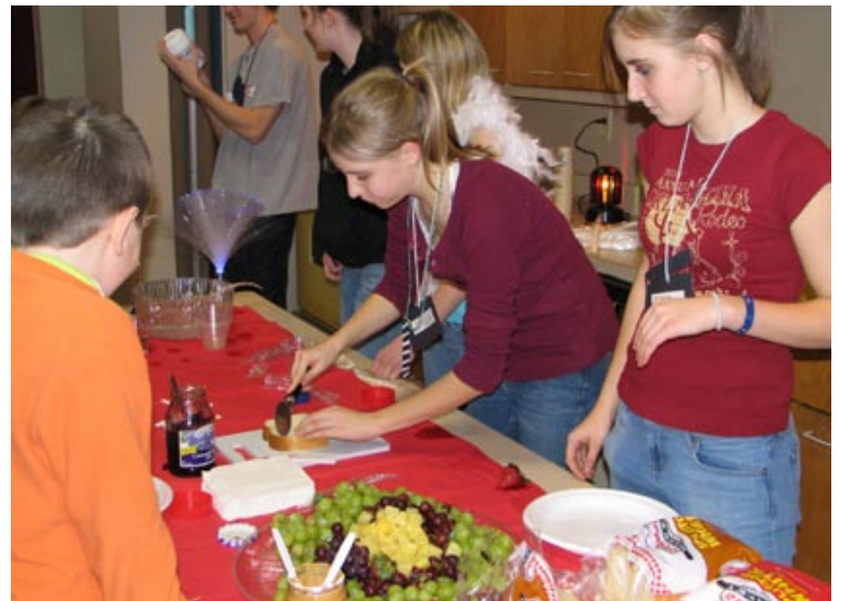
Teen Council formed several committees to organize the Lock-In. Members of the food committee prepared healthy appetizers for Lock-In participants.