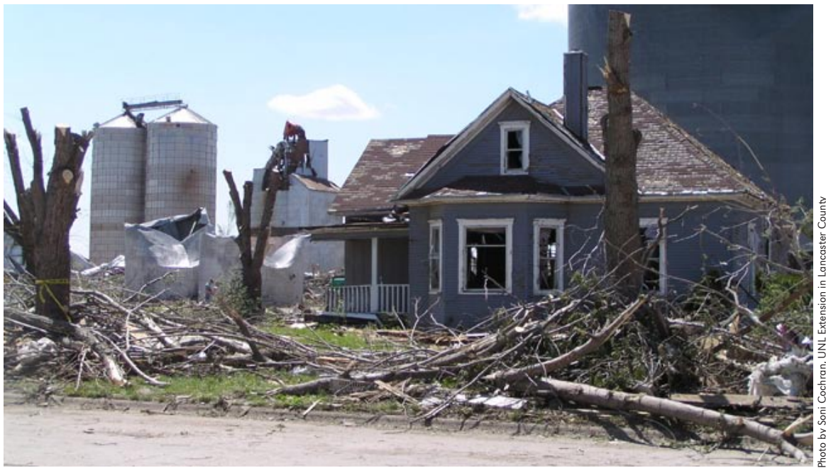
The Hallam tornado of May 22, 2004 was rated F4.