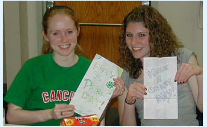
At their March meeting, nearly 20 4-H Teen Council members decorated more than 45 paper lunch bags for Tabitha Meals on Wheels.