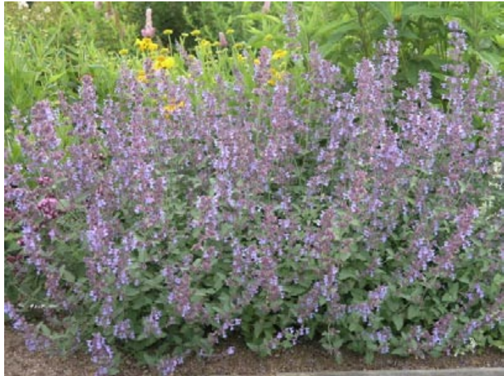
Nepeta "Walker's Low"

The Perennial Plant Association has awarded the title of Perennial Plant of the Year to Nepeta 'Walker's Low'. Introduced in 1988 in Europe, Walker's Low catmint has become increasingly popular with each passing year due to its lovely blue-violet flowers and its long bloom time, attractive grey-green foliage, ease of propagation, lack of pest or disease problems and low maintenance requirements.